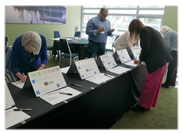
Voting on priorities